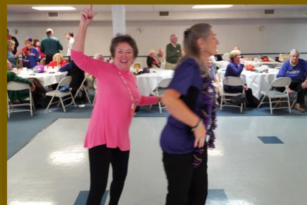
MAGGIE'S BACK IN TOWN