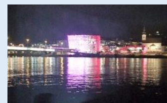
The harbor of Linz, Austria from our ship, Viking Legend

Austria, straddling the Danube River midway between Salzburg and Vienna. The riverside Lentos Kunstmuseum Linz has a major modern art collection. Across the river, the striking Ars Electronica Center focuses on society, technology and life in the future.