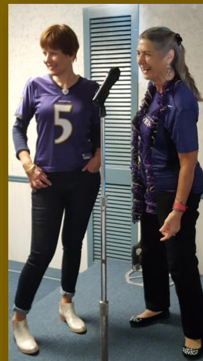
WHEN WILL I BE LOVED