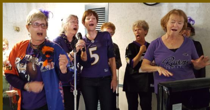
IT'S MY PARTY