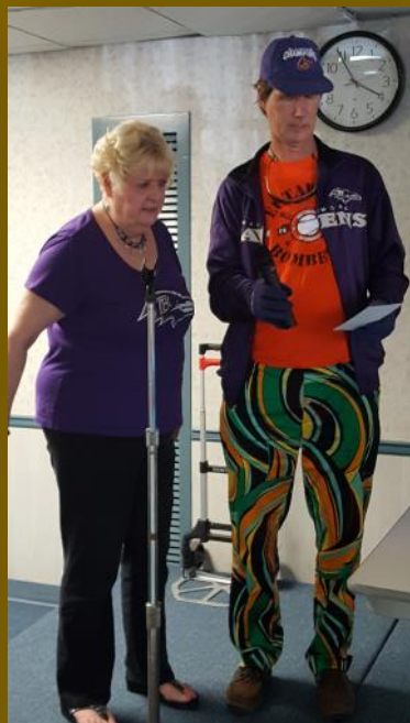
I CAN'T HELP FALLING IN LOVE WITH YOU

Click on any of the captioned photos to watch the video (internet connection required)